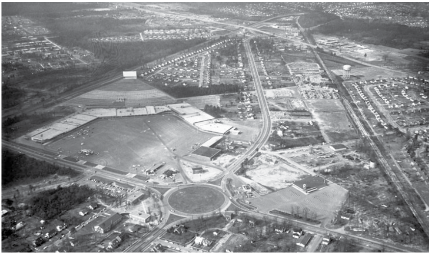
The Southside Plaza Area in 1960